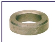
Hendrick'n/York Inner (Single)