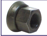
UNF Flanged 7/8 UNF