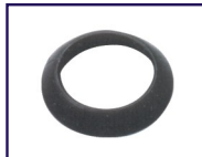
B.P.W. Inner M22 D.I.N.