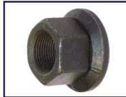
I.S.O. Flanged M22 x 1.5mm