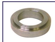
Hendrick'n/York Inner (Single)