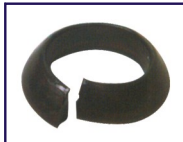
HF/BPW/SAF/York Outer M22 D.I.N.