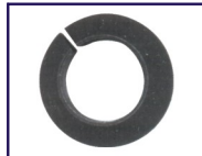
R.O.R. Inner 7/8 BSF