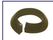
B.P.W./Meritor Inner (Single)