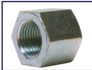
D.I.N. Standard M22 x 1.5mm