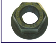
I.S.O. Flanged M22 x 1.5mm