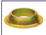
R.O.R. Inner M22 D.I.N.