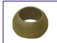
York Inner (Twin)