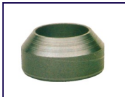
York Inner (Twin)