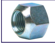
Universal 7/8 BSF x 11 TPI Depth