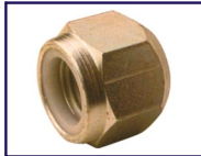
Nyloc Universal Cone 7/8 BSF x 11 TPI